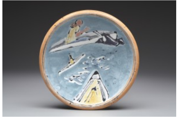
A Sketch of Mike fishing on Insula Lake